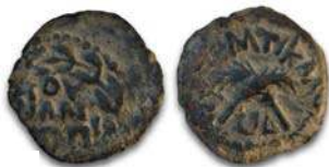
Image shows typical coins for illustration

These bronze prutahs circulated in Judaea from 52-62—roughly the span of Paul's various ministries. These were the coins used throughout the province at that time, and may well have been used by Paul himself.